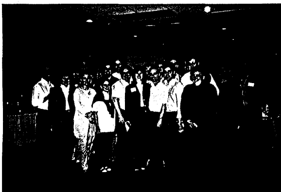
Wichita workshop participants

To meet some of the new demands of the institute world, Atlas began a series of small, management-oriented