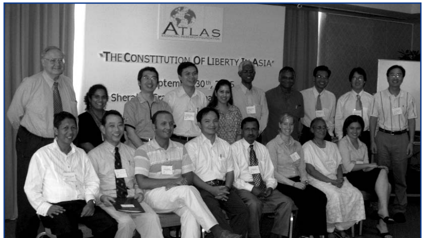
Twenty participants and observers from 16 organizations in 13 countries took part in this year's Asian Resource Bank, which was dedicated to an in depth discussion of F.A. Hayek's The Constitution of Liberty . The groups represented included:

But what are we to do when, say in the Philippines, the Chief Executive says sorry for being a fallible politician, urges everyone to follow the rule of law, and worst, proceeds to state that henceforth, the executive department will work with the appropriate authorities for an over-