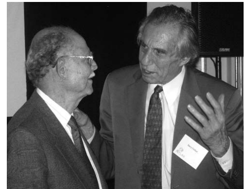
Radio personality Barry Farber (right) speaks with one of his heroes, Huber Matos (left), who gave one of the Toasts to Freedom at the dinner.

The next Freedom Dinner will take place on November 16, 2006 in Washington, DC. Please contact events@atlasUSA.org for more information.