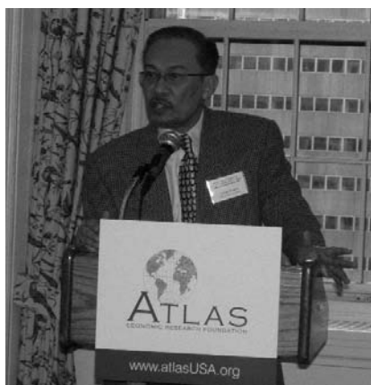
Anwar Ibrahim, pictured here at the human rights conference, also gave a Toast to Freedom at the 2005 Atlas Freedom Dinner on November 9th.