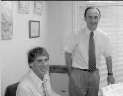
LyD founder Hernán Büchi and LyD Executive Director Cristian Larroulet.

AC: What has been the key to LyD's longevity? How have you survived the past 15 years?