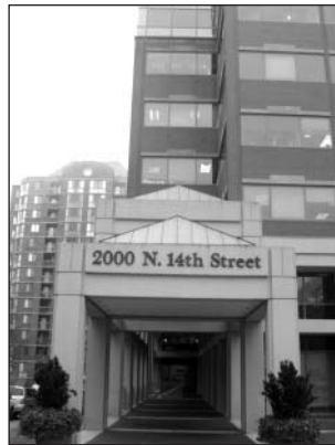
Atlas's New Office