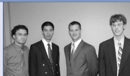
The 2004 BIPPS Interns

Ask for help: I work hard to persuade people to donate their time to help us. One of the first meetings I scheduled was with the director of the Economics Department at Western Kentucky University to ask him to design Bluegrass’s intern program. Nothing happened until