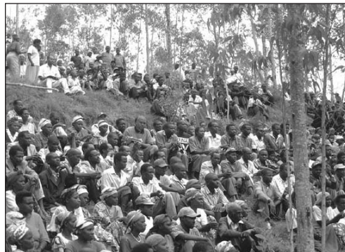
Organized by the hills they live on, Rwandan citizens take part in a gacaca [gab-cha-cha] meeting to settle disputes instead of using the UN International Criminal Tribunal. They apply this traditional local dispute resolution method to their reconciliation efforts and have also used it to establish and confirm their new judicial system.

I also came to the conclusion — after giving a talk on think tanks arranged by the Friedrich Naumann Foundation in Zimbabwe — that Africa needs more think tanks that use the moral arguments (not pragmatic cost/benefit analysis) like the Action Institute (Michigan) and the Objectivists to convince individuals of the merits of a free society. Africans