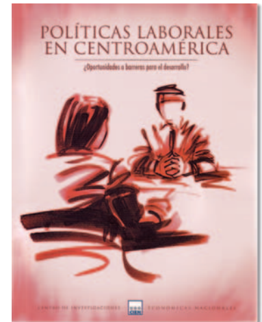
CIEN's recent study, Labor Politics in Central America: Opportunities or Barriers to Development?

much, not too little, “protection” for the workers. This so called protection is so costly that few can afford it. It encourages people to escape to the informal sector, (approximately 40% of Central American economy) or to the United States.