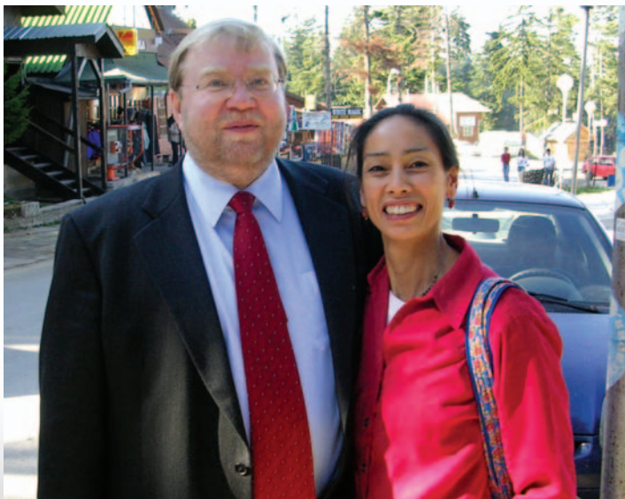
Former Estonian Prime Minister Mart Laar with Atlas’s Jo Kwong in Borovets, Bulgaria for the first European Resource Bank in October 2004.

For example, at the beginning of December, 2004, the government proposed a tax reform that would reduce the maximum marginal income tax rate for individuals and corporations to 20% from over 40% today. Atlas recruited Mart Laar, who introduced Eastern Europe’s first flat tax when he was Prime Minister of Estonia, to speak in Cairo in support of radical tax reform. Thanks to Mr. Laar’s attendance, organizers expanded a planned speech by economist Robert Hall ( The Flat Tax ) into a prominent one-day conference that also included Finance Minister Yousef Boutros-Ghali. The new law is expected to be passed soon.