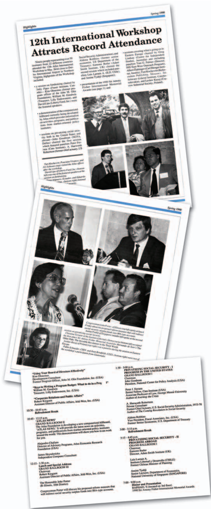
Shown here is the coverage of the 12th International Atlas Workshop from the Spring 1990 Highlights and a section of the conference program.

Independently of how successfully this year's Social Security debate ends, you can rest assured that the think tanks we support will continue in their efforts to enhance freedom throughout the world.