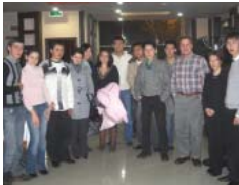
Student leaders from AIESEC in Bishkek