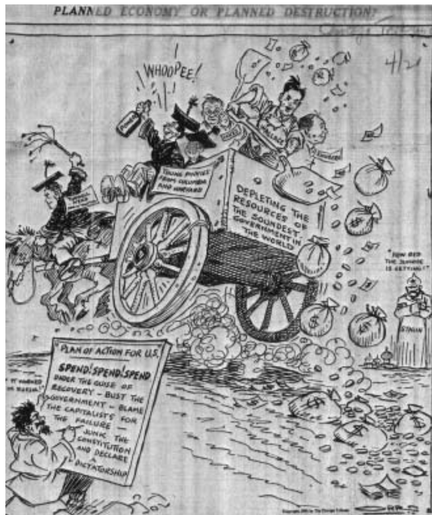
The names have changed, but you are forgiven if you mistook this New Deal-era cartoon (originally published in The Chicago Tribune in 1934) for one about the U.S. government's aggressive response to our current financial challenges.

Get involved with the Sound Money Project at AtlasNetwork.org! Compete for a $5000 top prize in the Sound Money Essay Contest, and participate in a survey as a prelude to possible grants for your think tank's future work on sound money.