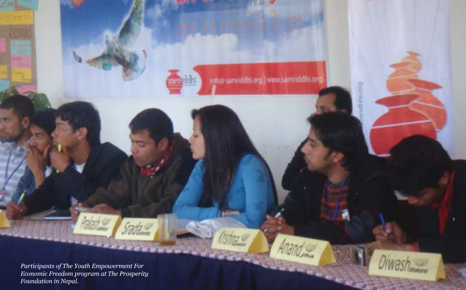
Participants of The Youth Empowerment For Economic Freedom program at The Prosperity Foundation in Nepal.

But Sitoula takes a unique perspective on these challenges: “Wherever there are challenges, there are opportunities. The political turbulence of recent years has led to the drafting of a new constitution, and we are determined to have an impact on the shape it takes. We have learned that antagonism to entrepreneurship and economic freedom weakens when you discuss it as a means for achieving prosperity, a goal we all can agree on.”