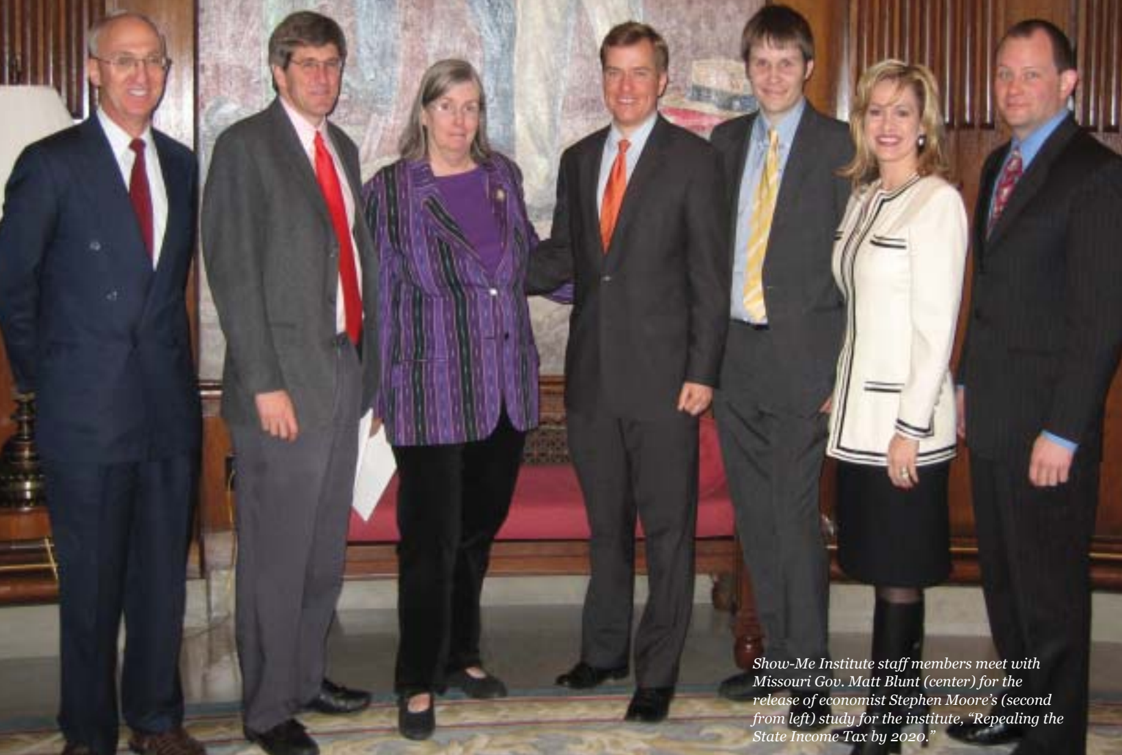
Show-Me Institute staff members meet with Missouri Gov. Matt Blunt (center) for the release of economist Stephen Moore's (second from left) study for the institute, "Repealing the State Income Tax by 2020."

It often seems as though the growth of government will never cease. Trends point to massive spending increases, government intervention in the economy, and large segments of the public clamoring for more. The situation is not hopeless, however. During the past several years, state-based and regional free-market think tanks have sprouted up throughout the United States, bringing economic wisdom and a passion for liberty to policymakers and citizens on a local, individualized basis.