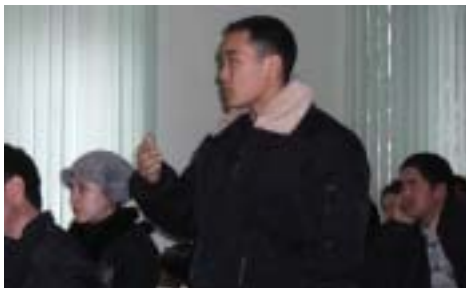
A young student from the Technical University of Osh poses a question on the foundations of liberty.